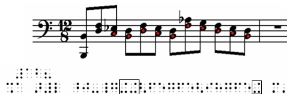
Figure 4. Example of Braille character reduction.

When the same interval appears several times the first interval sign is doubled and then one interval sign is placed at the end.