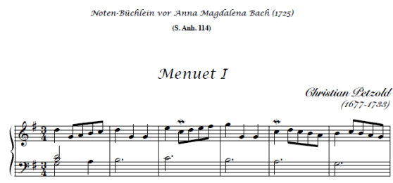
Figure 5. The Minuet in pdf.

http://imslp.org/wiki/Notebooks_for_Anna_Magdalena_Bach_%28Bach,_Johann_Sebastian%29