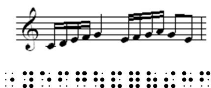
Figure 3. Example of Braille dot reduction.

The first note of the first double group is written with dots 3 and 6 but for the other note these duration dots are missing. The same reduction is not possible in the second part of the example because there would be an ambiguity with the last two notes.