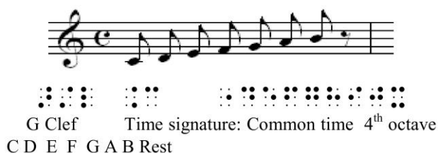
Figure 2. A simple score in Braille.

So a short simple score will be transcribed: