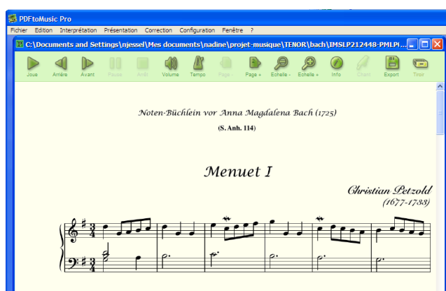
Figure 6. The Minuet after music recognition.

We use the trial version of the Myriad-online.com product call PDFtoMusic Pro to convert the pdf score into MusicXML format.